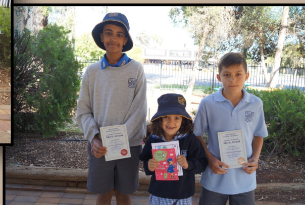
Above: Award winner for Wednesday 9th December