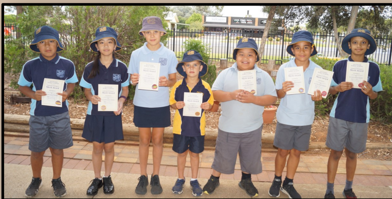
Left: Award winner for Friday 3rd December