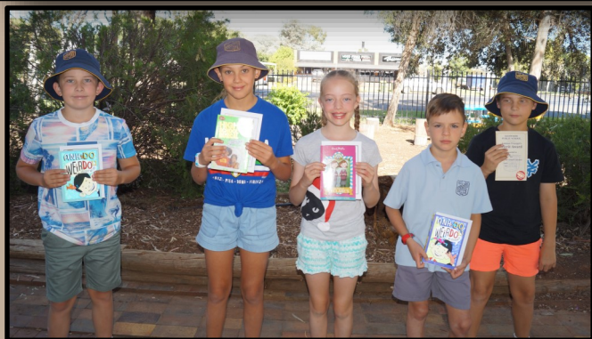
Below: Award winner for Monday 7th December