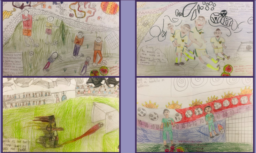
Examples of visual literacy based on Pele

3/4DM have been experimenting with creative narrative orientations with descriptive language.