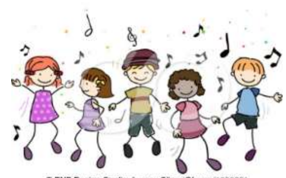
© BNP Design Studio * www.ClipartOf.com/105225

We look forward to seeing many students dancing the night away.