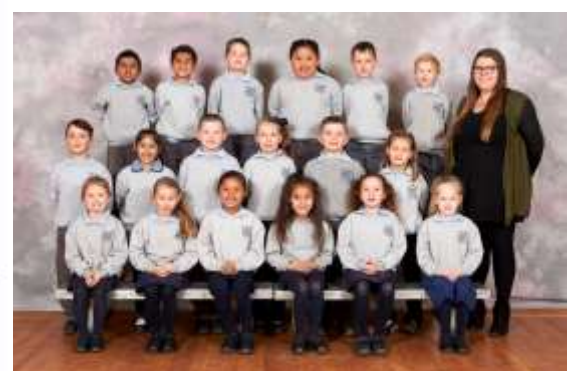
KB CLASS PHOTO